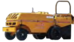
RG 50 Diesel Powered

1,400 lb (635 kg) 105.5" (268 cm) 48.5" (123.2 cm) 34.5" (87.6 cm) 46" (116.8 cm) Self-Propelled hydraulic, variable speed Briggs & Stratton Vanguard 35 hp (26.1 kW) 6.5 gal (24.6 L) 18 total 14" (35.6 cm) 26" (66 cm) 38" (96.5 cm) "Quick Stop" Cutter Wheel Clutch Brake Variable Travel Speed Variable Swing Speed Hydraulic Steering