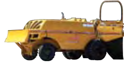
Super RG 50 Diesel Powered

2,800 lb (1,270 kg) 123" (312.4 cm) 45.2" (114.8 cm) 35" (88.9 cm) 51" (129.5 cm) Self-Propelled hydrostatic, variable speed Deutz 3-cylinder, diesel, 49 hp (36.5 kW) 9 gal (34.1 L) 18 total 15" (38.1 cm) 30" (76.2 cm) 67" (170.2 cm) Variable Speed "Quick Stop" Cutter Wheel Two Speed Travel Variable Swing Speed Hydraulic Steering