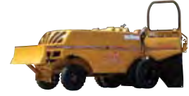
RG 90 Turbo Charged Diesel Powered

3,300 lb (1,497 kg) 144" (365.8 cm) 45.2" (114.8 cm) 35" (88.9 cm) 51" (129.5 cm) Self-Propelled hydrostatic, variable speed Deutz 4-cylinder, diesel, 66 hp (49.2 kW) 10 gal (37.9 L) 24 total 18" (45.7 cm) 30" (76.2 cm) 72" (182.9 cm) Variable Speed "Quick Stop" Cutter Wheel Two Speed Travel Variable Swing Speed Hydraulic Steering Hydraulic Push Blade 4-Wheel Drive