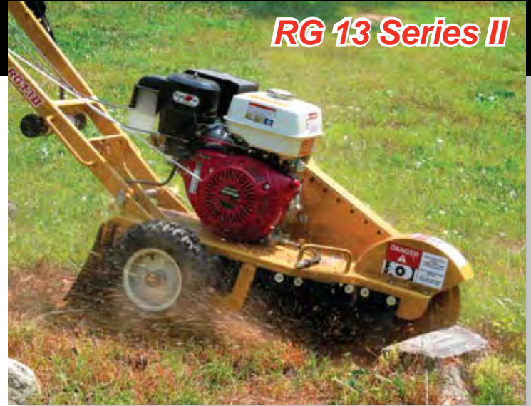
RG 13 Series II