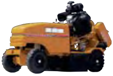
RG 1635 Super Jr Gas Powered

1,400 lb (635 kg) 105.5" (268 cm) 48.5" (123.2 cm) 34.5" (87.6 cm) 46" (116.8 cm) Self-Propelled hydraulic, variable speed Briggs & Stratton Vanguard 35 hp (26.1 kW) 6.5 gal (24.6 L) 18 total 14" (35.6 cm) 26" (66 cm) 38" (96.5 cm) "Quick Stop" Cutter Wheel Clutch Brake Variable Travel Speed Variable Swing Speed Hydraulic Steering