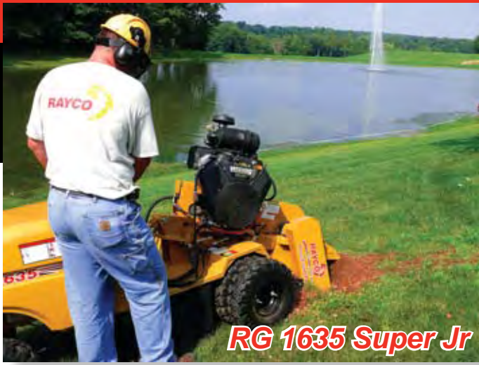
RG 1635 Super Jr

RAYCO is the innovator of the self-propelled backyard stump cutters. Whether you are looking to add an economical backyard machine to your fleet such as the Super Jr or put diesel power through the gate like the RG 50 , Super RG 50 , or RG 90 , RAYCO has you covered. The Super Jr is equipped with a "quick stop" cutter wheel clutch brake, and can be outfitted with optional dual wheels for extra flotation or stability. The diesel powered RG 50 , Super RG 50 and RG 90 are hydrostatically driven with the engine mounted level giving them a lower center of gravity allowing them to cut on steeper inclines with less risk of oil starvation. The Super RG 50 and RG 90 have a hydraulic push blade and 4-wheel drive as standard features.