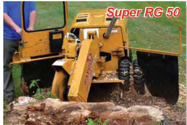
Super RG 50